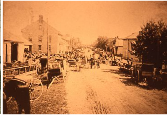
Arthur St. S., 1903 Pig Fair Day

The only ornamental work is a Romanesque arch and semi-circular transom light over what was then the main entrance, with a small classically-styled portico consisting of a triangular pediment with dentils and Ionic columns.